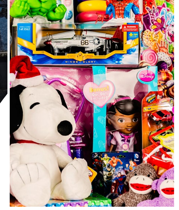
Toys, gift cards and cash make the season brighter for many families.

Holiday Assistance gives businesses, organizations, families and individuals a chance to adopt a family or child for the holidays. Children receive requested toys and clothing and parents are given grocery gift cards to help make the season brighter. In December 2017, 127 families, including 348 children, benefited from the generosity of a caring community.